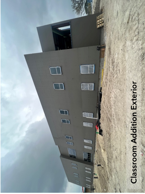
Classroom Addition Exterior