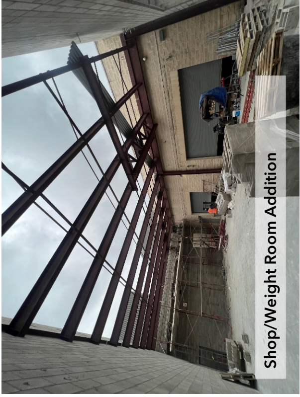
Shop/Weight Room Addition