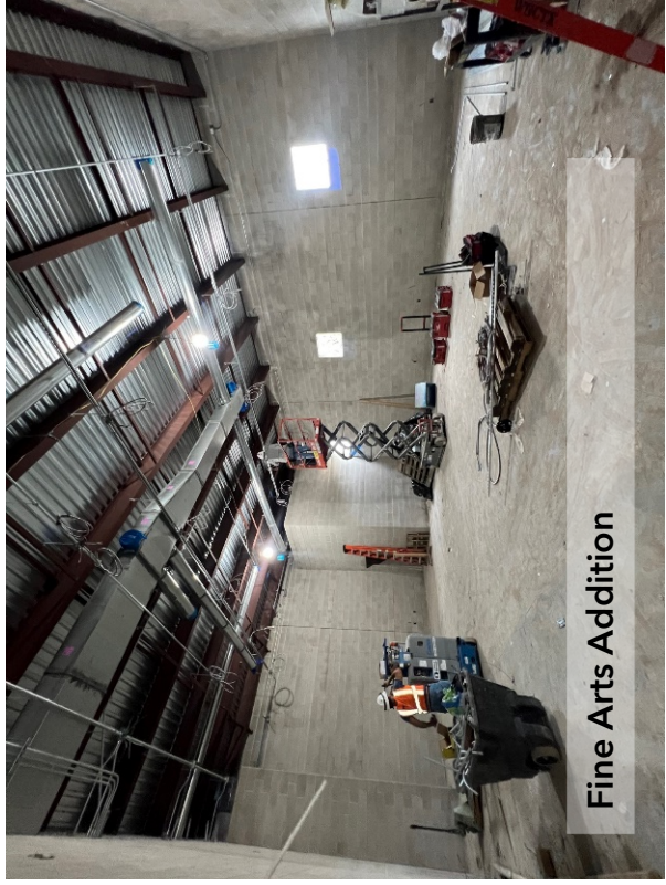
Fine Arts Addition