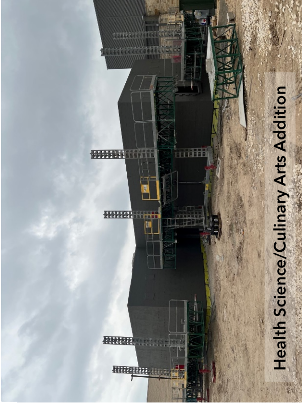
Health Science/Culinary Arts Addition