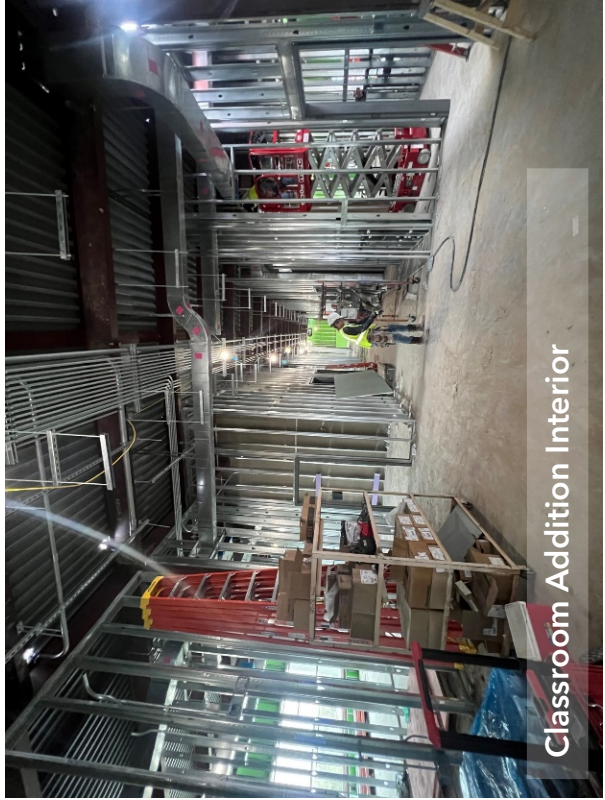
Classroom Addition Interior