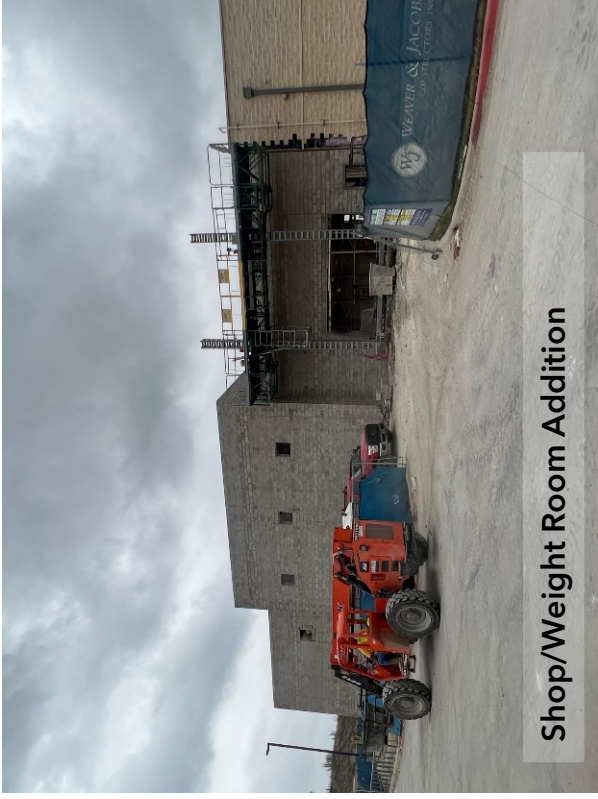
Shop/Weight Room Addition