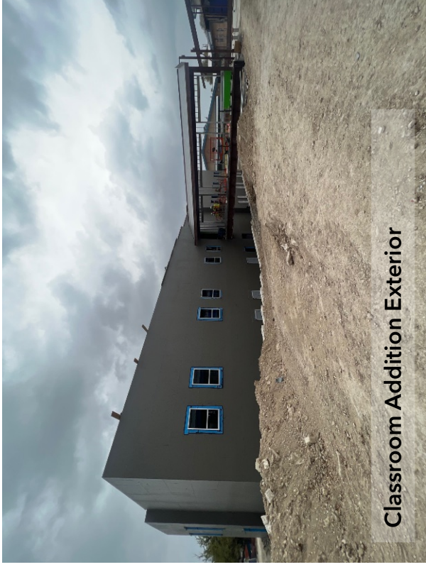
Classroom Addition Exterior